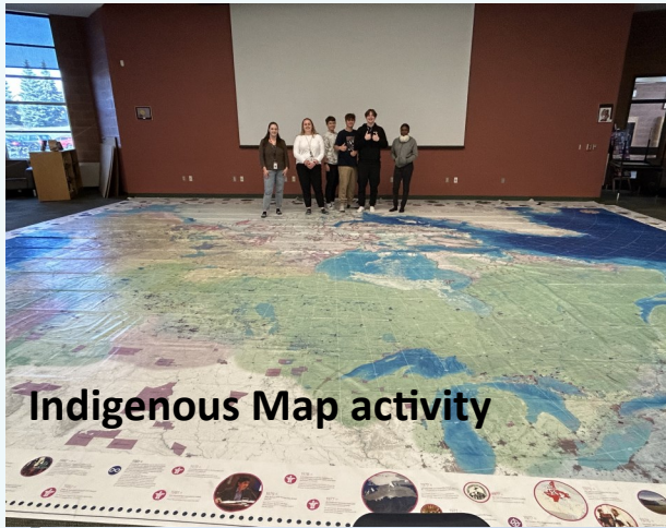
Indigenous Map activity