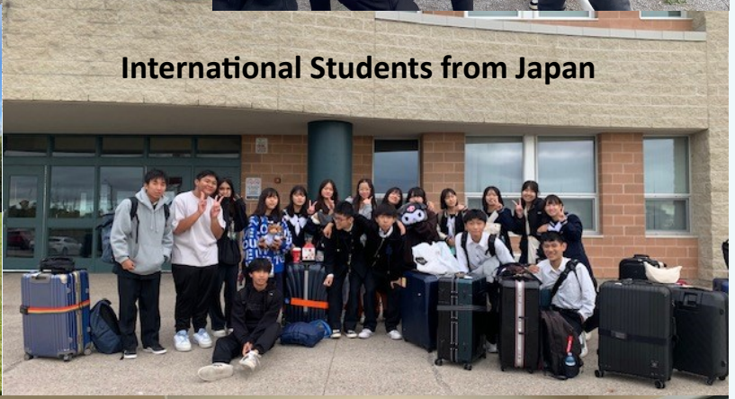
International Students from Japan