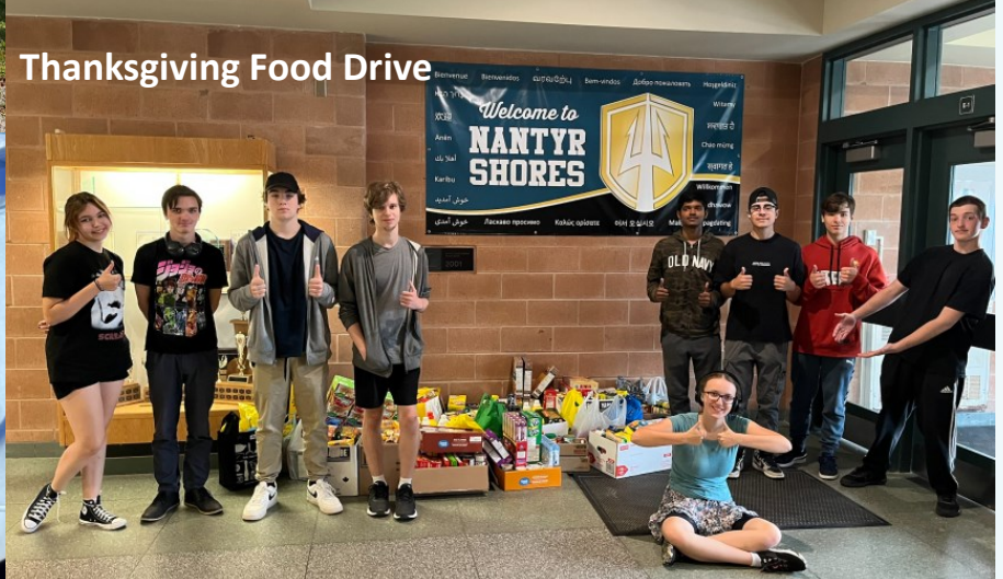
Thanksgiving Food Drive