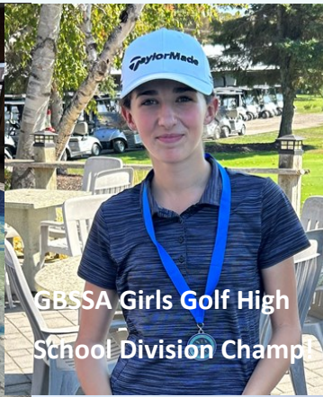
GBSSA Girls Golf High School Division Champ