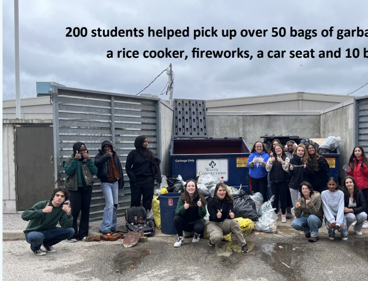
200 students helped pick up over 50 bags of garbage including a rice cooker, fireworks, a car seat and 10 bricks!